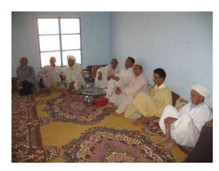
Community meeting in preparation of the project