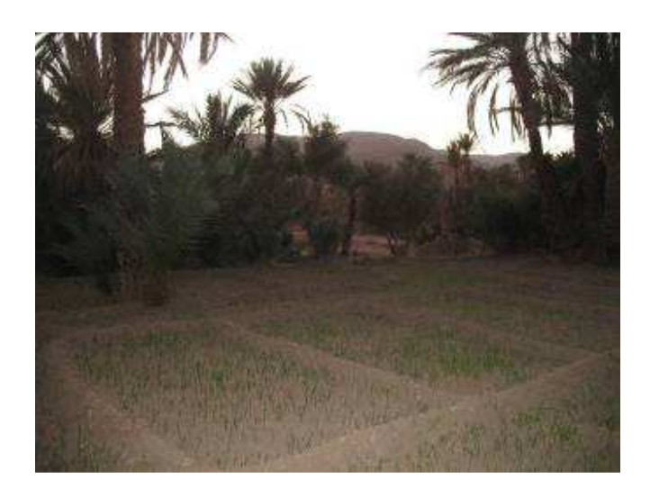
Cereal crops protected by the palm trees