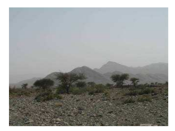
Igoul site – forestry and micro-catchment component