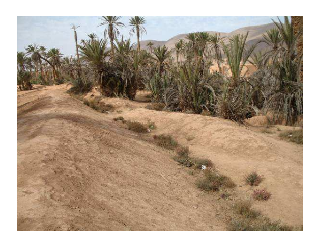
Tracing of old water pipes