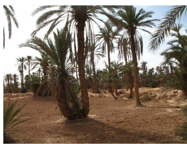
The Targmuiste palm grove: in a state of advanced degradation (pictures above)