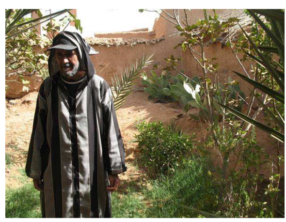
Members of the association in one of the last oasis gardens of the village