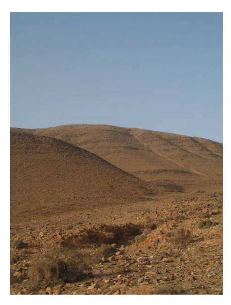
Site of forest plantations and microcatchments