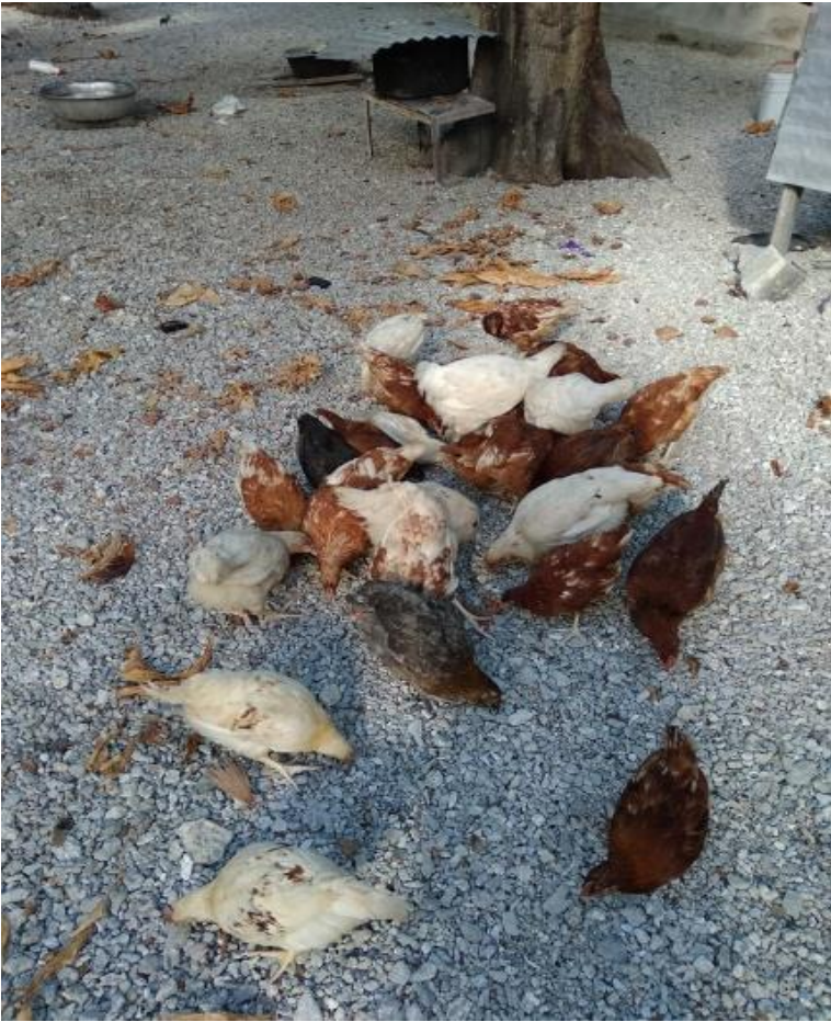
Poultry to be distributed