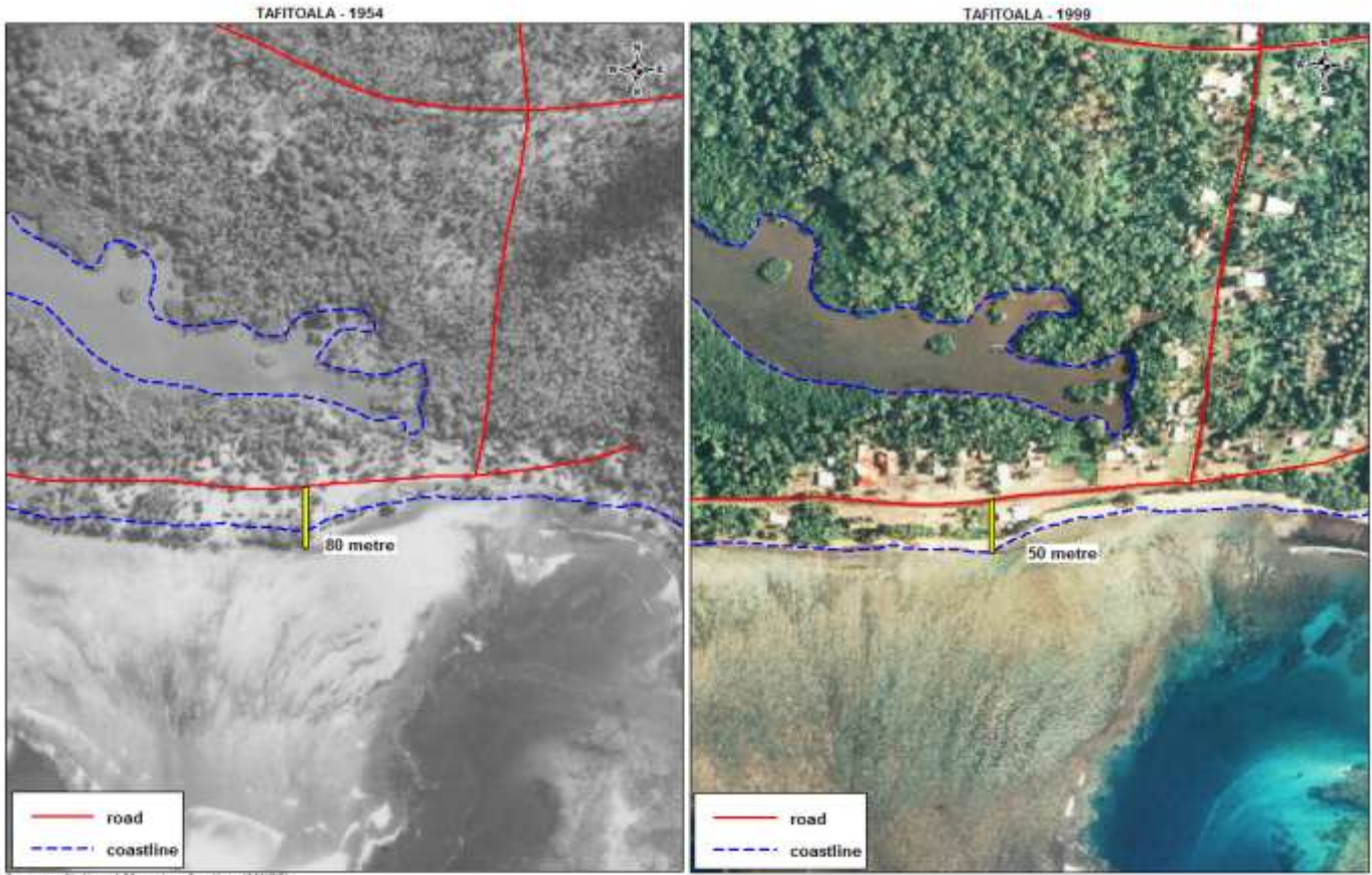
Figure 1 Tafitoala coastal erosion from 1954 to 1999

Looking at the satellite photos from 1954 and 1999, provided and processed by the Ministry of Natural Resources and Environment, emerges that the loss of coast is approximately 30 meters over this period. This number is subject to high uncertainty because it has been measured without taking in account the tides and different seasons. Moreover it is based on a single measurement instead of being an average of multi measurements.