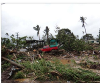
Destruction caused by the cyclone along the Vaisigano River in Apia

In December 2012, tropical cyclone Evan struck the fragile islands of Samoa, leaving severe, long-term devastation in its path including 7,500 displaced people; 2,000 damaged homes; 5 deaths along the flooded Vaisigano River; destroyed crops, buildings, businesses (including hotels and restaurants) and roads; disrupted electricity and communications nation-wide;