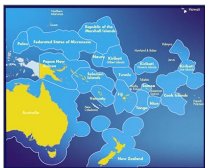
Map of Pacific Region