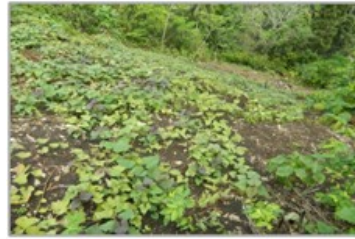
A typical potato garden on a steep hill in North Malaita. The topsoil has been washed away as a result of continuing gardening in the same area for years.

People have been using steep hillsides to plant their crops because flat lands along the coast have been used to build villages and plant