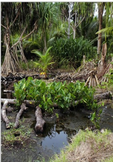
Pulaka swamp in Nanumea Island Photo: Yusuke Taishi/UNDP

Contributed by: Yusuke Taishi , UNDP Asia Pacific Regional Centre