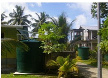
Newly installed household water tanks and guttering to capture and store rainwater

(Continued from page 4) - Supporting Climate Change Adaptation in the Pacific