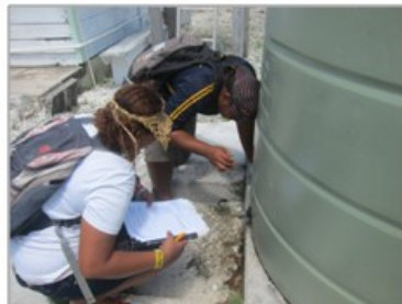
Tokelauan youth participating in water quality testing

Contributed by: Secretariat of the Pacific Regional Environment Programme (SPREP)