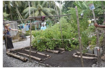
Home garden in Nukulaelae Island

Through the first climate change adaptation project in Tuvalu, financed by the LDCF and AusAID, with support from UNDP, communities' capacity is being built to retain water more effectively and