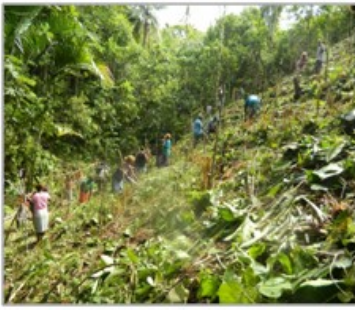
A newly established farming system demonstration plot in North Malaita, used to introduce new farming methods (such as terracing). A demonstration center will distribute seedlings to farmers.

(Continued from page 3) - Supporting Climate Change Adaptation in the Pacific