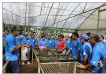
VANUMA Nursery Training for communities

(Continued from page 2) - Supporting Climate Change Adaptation in the Pacific