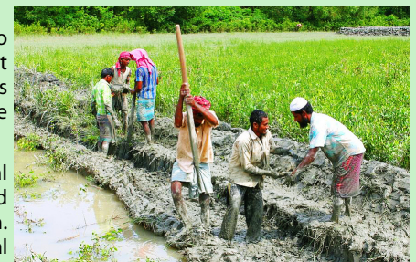
Community members from Char Kukri Mukri build mounds for protective and productive plantations, Bhola District, Bangladesh

Currently working with the Government of Bangladesh in the coastal districts of Patuakhali, Bhola, Noakhali and Chittagong, this project represents immense opportunities for up scaling in Bangladesh and to yield lessons for other vulnerable coastal populations throughout Asia.