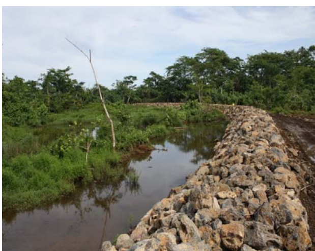
A retaining stone wall to protect the coastal ecosystems from flooding