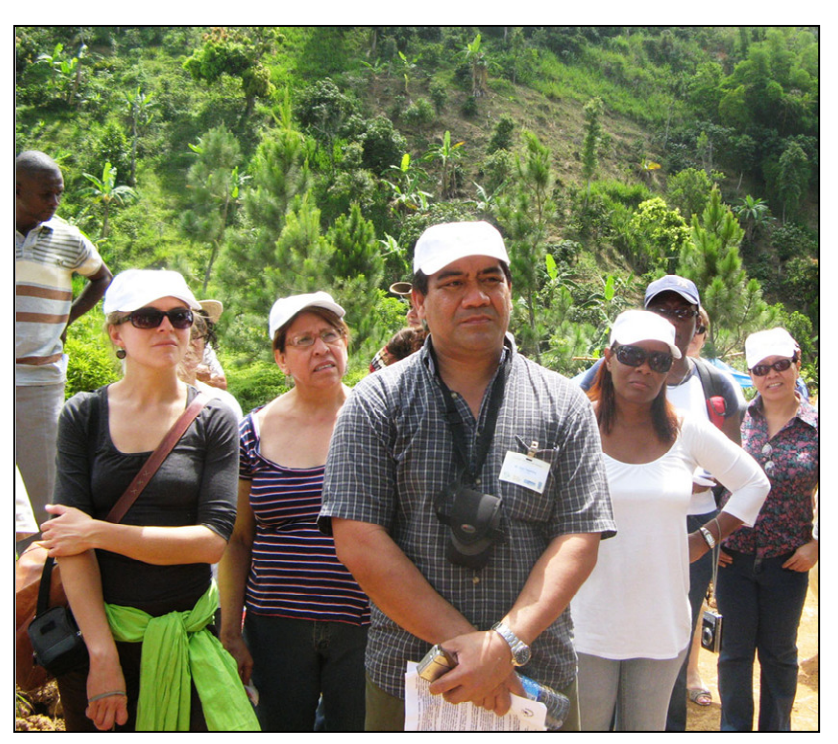
Workshop participants listening to a presentation during a field visit to a CBA Jamaica project site near Kingston.