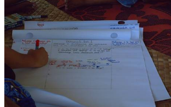
Fig 8 H-Form on newsprints used to present VRA questions. Photo dated 02 May 2009

The four indicator questions along with the common themes in the answers to the questions, the score and all information gather from the initial VRA consultation phase are presented in the following table.