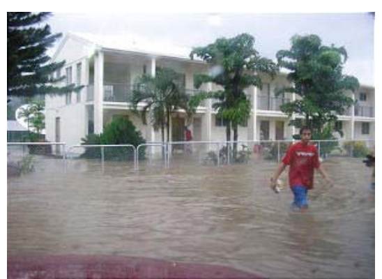
Fig1. Flooding within LDS compound at Pesega Dated 5<sup>th</sup> February 2006