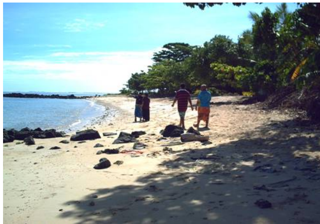
Fig 4. Coast of Lelepa Village. Photo dated 02 May 2009