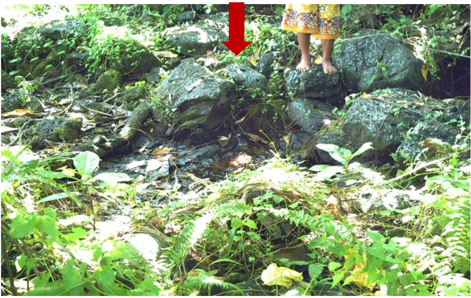
Fig 6. Sogi pool. Currently in bad condition (due to sedimentation and siltation). Pool often overflows during heavy rainfalls. Photo dated 02 May 2009

The village is connected to the district main source of water supply, however during intensive rainfalls or cyclones the water distribution network often breaks down limiting the community's access to water. The village relies on a small spring (Sogi) located inland to obtain water. Unfortunately the state of the pool (no protective wall) reduces water available (low quantity) as well as poor quality due to siltation and sedimentation from nearby wetland areas and from agricultural runoff.