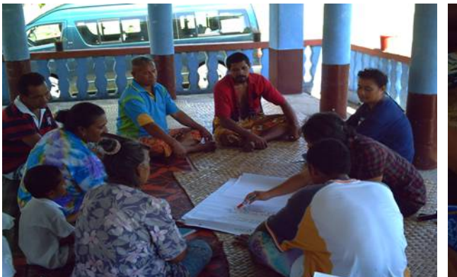
Fig 7. Women and aumaga discussing VRA questions. Photo dated 02 May 2009

Gender equality was taken into consideration as well as inclusion of young untitled men (aumaga) in the VRA discussions. The VRA consultation process (including questions) was conducted in the Samoan language.