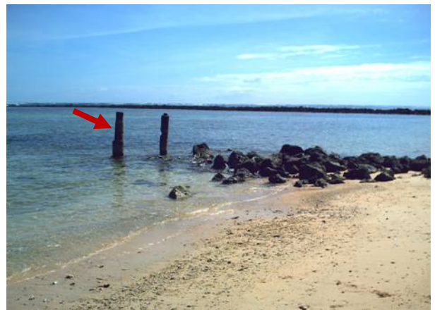
Fig 5. Leftover poles from old residential buildings. Indicator of where people use to live and hence evidently indicate that the coast line have since moved inland. Photo dated 02 May 2009