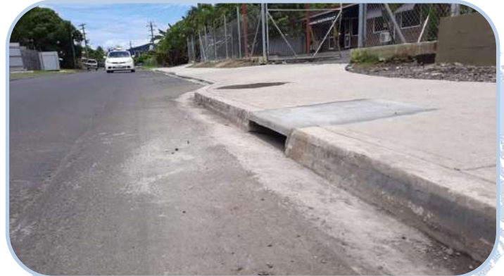
Site 3: Savalalo St between Vaea St and Fugalei St (Body Shop to Manai Restaurant)