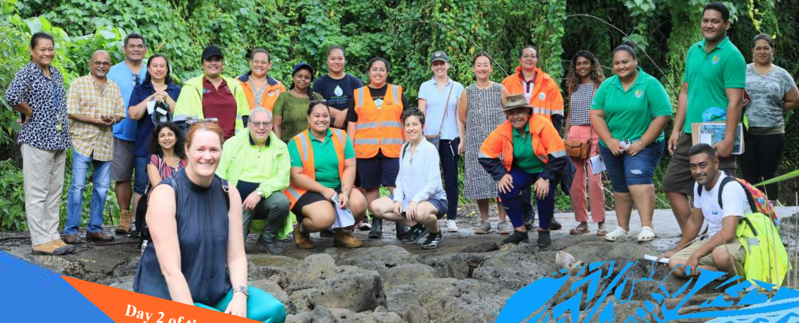
Day 2 of the GCF Mission - Site Visit group photo