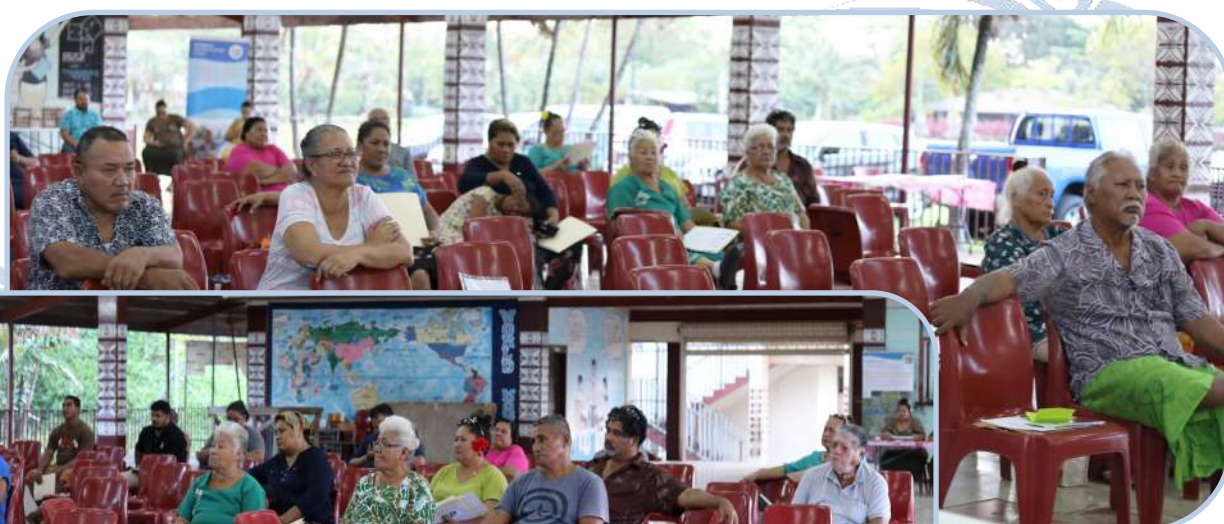
Day 1 for Villages of Apia, Malifa, Maluafo, Lelata, Ma'agao, Vailima and Tanugamanono

The MNRE supported by the GCF-PMU held community consultations on 5 th & 6 th October 2022 at the Maluafo College Hall with affected residents of the VRCA on the implementation and installation of the Flood Alert Sirens within the VRCA. This initiative was implemented for fourteen (14) villages of the VRCA that are within the high impact level of siren sounds. The two days event involved the collaboration between three MNRE core operating agencies: the Disaster Management Office (DMO), the Water Resources Division (WRD), and the Samoa Meteorology Division (SMD), as well as the MoF and the GCF-PMU.