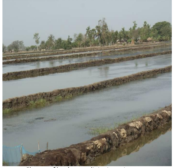
Change of land use: salinity intrusion promotes shrimp culture over rice farming

This CBA project aims to the minimize climate change impacts of 400 households in the Atulia Union located in the southwestern coastal region of Bangladesh. The project area is considered one of the most vulnerable areas to climate change due to its close proximity to water and high levels of poverty. Rice cultivation is the primary source of livelihood yet a significant number of families are either landless, living on Khas (public) land, or own only a negligible amount of cultivable land. Aquaculture is also an important source of income, are fishing, day labouring and poultry and livestock rearing. Over the last few decades both farming and aquaculture activities have become less productive as soil degrades, water salinizes and competition for resources increases. Currently, more than 56 percent of the population in the area is food deficient for two to six months a year. Severely damaged by Aila, the 2009 cyclone, the soil and water ecosystems in the area became weakened due to high salinity intrusion and are thus more vulnerable to subsequent climatic impacts. Villages in the area also suffered from damaged infrastructure, loss of property and loss of livelihood during the cyclone. These effects continue to hinder the development of the area.