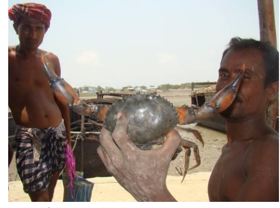
Local fisherman who rely on the sustainable production of aquatic species

The community will benefit from improved aquaculture practices and reduced negative pressure on natural aquatic animals to enhance livelihood opportunities. Both the community and local ecosystem will have improved resilience to detrimental climate change impacts and be able to pursue sustainable development.