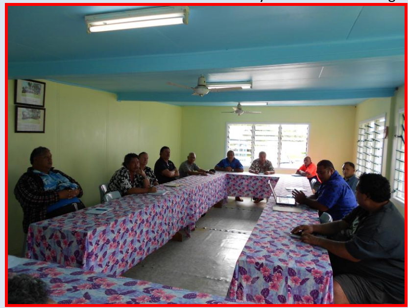
Photo: SRIC-CC PMU meets with Mangaia Pa Enua Island Council to finalise arrangements for delivery of the MGLAI project and the Tamarua household water tanks project.

Photos: Meeting between SRIC-CC PMU and the Mangaia mainstream and home gardening Farmers. The meeting attracted many people. The photo to the right is a home gardens project green house that will be modified to also be a nursery for farmers working on the MGLAI project.