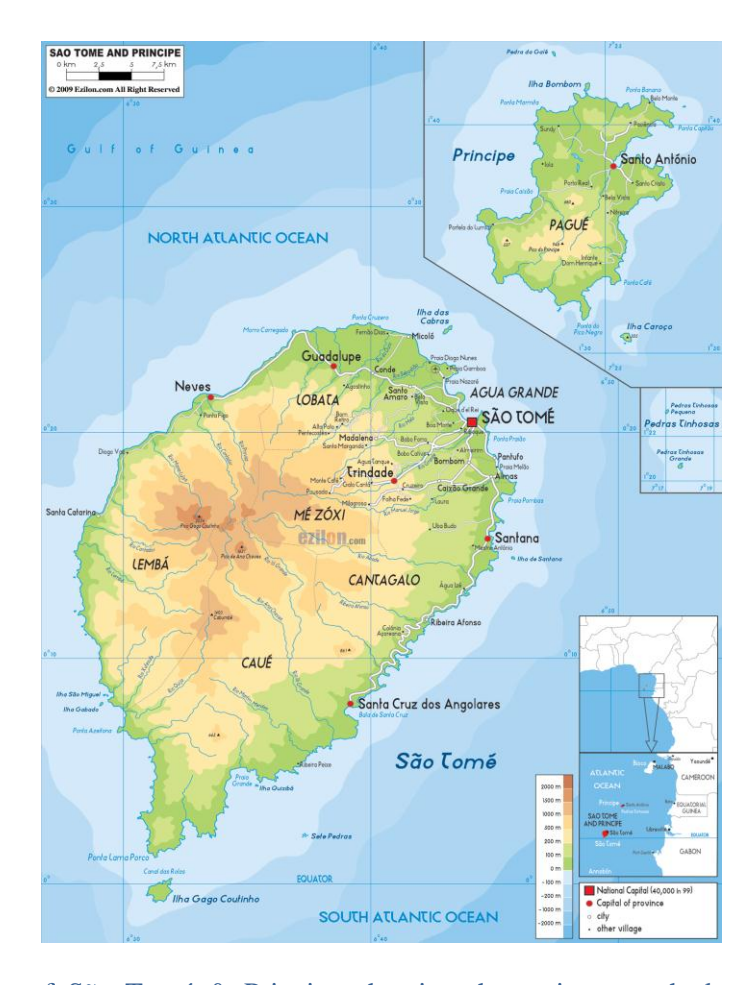
Figure 1. Map of São Tomé & Principe showing the main watershed network and the six intermediate watershed (Cantagalo, Caué, Lembá, Lobata, Água Grande, Mézóxi) flow ratessubdivisions.

The Hydrology Department had in 1960 a monitoring and collection network made up of 13 Manual Hydromet stations distributed over both Islands. However by 1970 the number of monitoring stations reduced to 5 Manual Hydromet Stations. With all the changes that took place during and post independency period the GoSTP decided in 1980 to renewed the entire HD network with 13 manual Hydromet station measuring water level, flow rates and meteorological data (Rainfall, Relative Humidity and Air temperature). Unfortunately between 1980 and 2011 the entire Hydromet network was vandalized due to common believe that Mercury in the thermometers was a precious metal with a high commercial value.