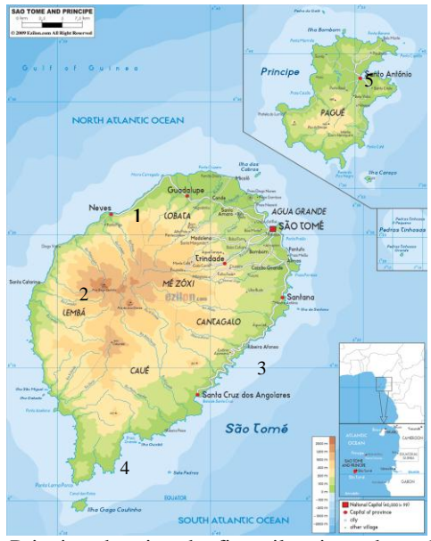
Figure 1. Map of São Tomé & Principe showing the five pilot sites where the ICB_EWS will be installed.