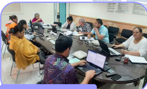
Meeting with UNDP on 2022 APR

The PMU later met with the UNDP on 2 nd February 2023 to review, discuss feedbacks, and finalize inputs to the Draft 2022 APR.