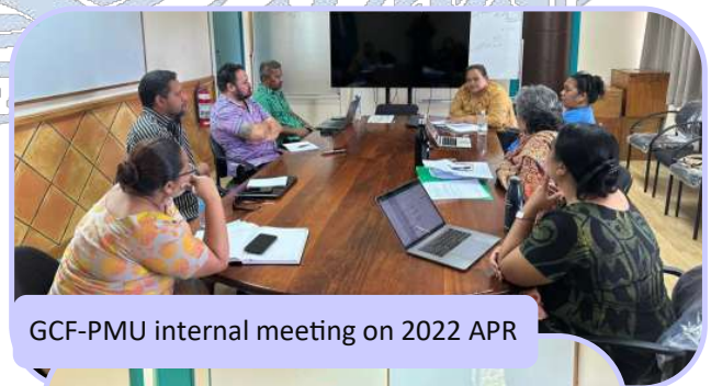
GCF-PMU internal meeting on 2022 APR