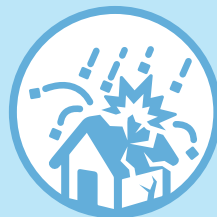
Destruction of hotels

Higher sea temperatures can damage delicate coral reefs, impacting diving and fishing around the island