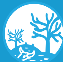
Severe water shortages and droughts