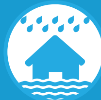
Rising sea levels