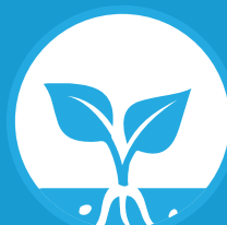
Lower crop and fish yields