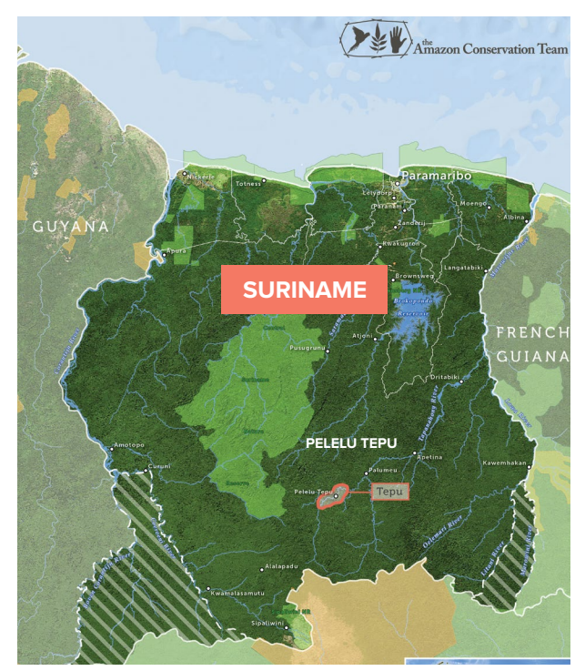
Map showing the location of Pelelu Tepu

The Village of Pelelu Tepu, a remote indigenous community only accessible by chartered flight, was dependent on a generator and diesel to power the entire 84-household community. With this outdated system, the villagers only had electricity for 8 hours per day. This impacted the quality of education available, the quality of life of the villagers, and made day-to-day tasks more difficult. Additionally, due to the remote location of the village, sourcing fuel for the generator was an expensive and laborious process.