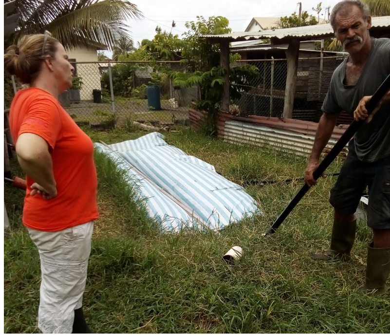
Pelelu Tepu villagers