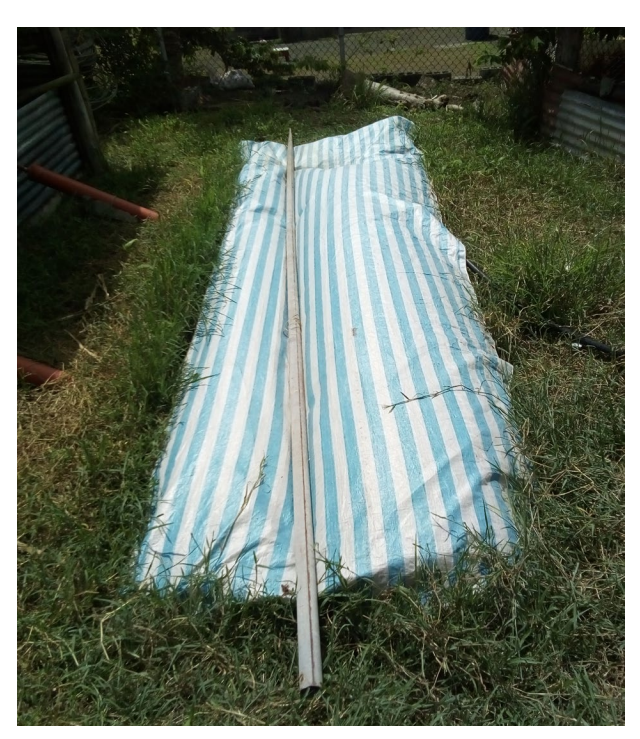
Pictured above is a large component of a biodigester system which uses a bag to allow for an easier installation process.

This project, which included 20 farmers, was designed to reduce each farmer's vulnerability to the effects of climate change, by constructing small water harvesting systems on small livestock holdings to harvest rainwater for later use. The project procured pelletizers to produce high quality forage for periods of droughts or floods, and provided resilient tropical breeds of goats to support the growing goat milk industry. Finally, as it relates to energy efficiency and renewable energy, the project installed two biodigesters on pig farmers' holdings to convert waste into renewable energy in the form of methane gas. The remaining bi-product from the process can then be used as organic fertiliser.