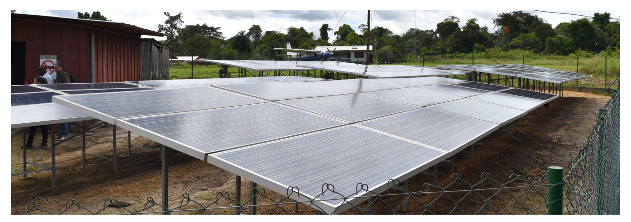
Solar PV system installed in Pelelu Tepu

In the case of Saint Vincent and the Grenadines, the biodigester provided farmers with an energy source necessary to increase their product range. Before the renewable energy supply, farmers explained that their heating came from wood fire. This heat supply could not reach the temperatures required to manufacture additional products needed for business expansion. With the use of the biodigester however, farmers in the community are now poised to improve their livelihood and capacity for wealth creation through the product diversity and business expansion that the renewable energy source provided.