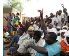
Inspiration in Action!