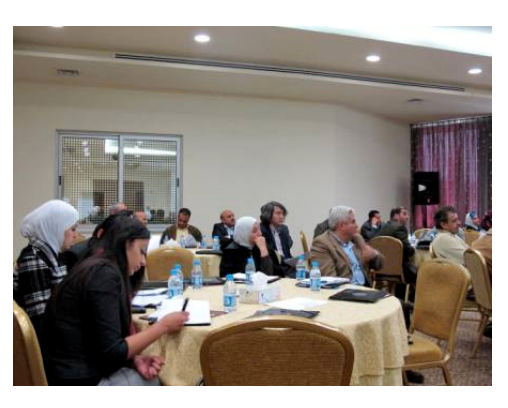
Delegates at the Jordan Inception Workshop, Photo: WHO

port Jordan to make reclaimed water use efficient and safe.