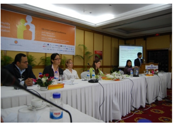
Participants at CBA Conference.

WHO's Joy Guillemot, chaired a session dedicated to health adaptation and facilitated a dialogue among health and climate adaptation partners on how to best protect public health from climate impacts. Public health practitioners from five countries implementing health adaptation projects, shared experiences, approaches and future plans and discussed how communities and the formal health sector can work together to protect vulnerable people from the health risks of climate change.