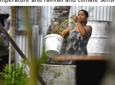
Drawing water from a well during a drought.

The project Technical Working Group (TWG) met in June to undertake the first part of this analysis and will work over this year to