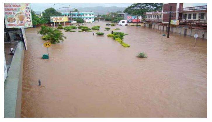
Flooded Ba Town.

The timeliness of this meeting and the project overall cannot be emphasized enough. Recent media reports of a possible typhoid epidemic in the Bua province and an alarming number of cases of leptospirosis in rural areas have helped focus attention on the burden of disease posed by these infections in Fiji. The Fiji project will support existing government efforts to reduce the impact of such outbreaks by strengthening health sector surveillance and response capacity, constructing evidence-based early warning systems, and using public education and health promotion strategies related to CSD's.