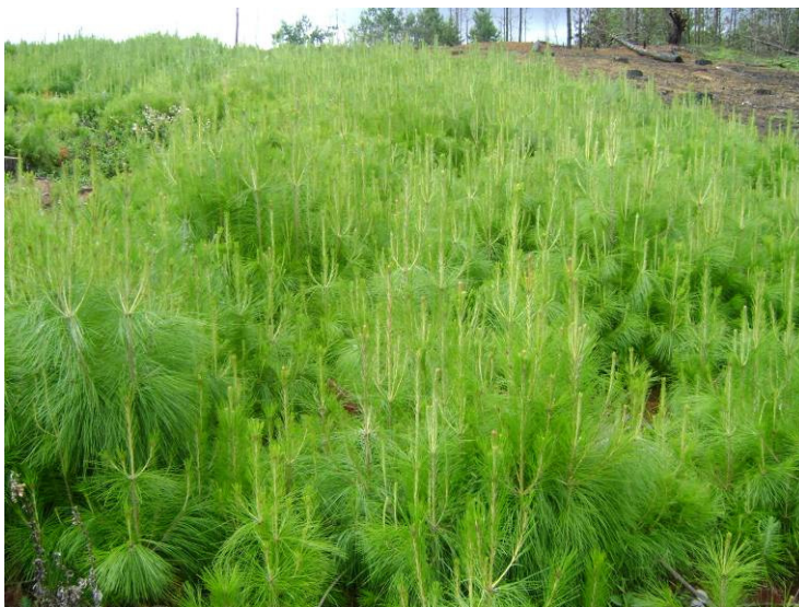
Picture 3. Regenerants from natural regeneration in harvested areas