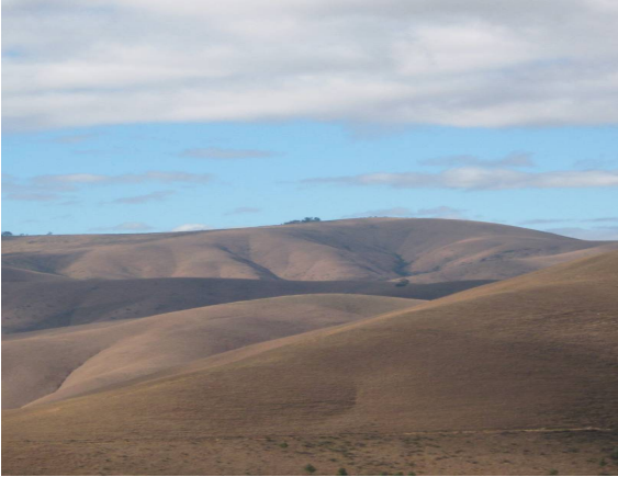
Picture 2. Grassland vegetation of Makete

Tree species selection depends mostly on the objectives (e.g., conservation, fuelwood, fibre, or sawlog production). Pinus patula and Cypress (mainly Cupressus lusitanica ) are the most preferred species for timber while Eucalyptus is being used for firewood and poles. However, the mentioned trees species are not suitable for planting in catchment areas and water springs due to their fast growth which results in mining water from the soil. Indigenous species should be planted in such areas. Apart from the production of timber, indigenous species are planted in water source areas for soil conservation purposes. The species include Hagenia abyssinica (mdobori), Juniperus procera (minoge) Catha edulis (mgambo), Syzigium cordatas (mvinge) and Sylix subsilata (Mazivizivi). Indigenous species also recommended for Makete district and other highland areas includes: Cordia africana , Vitex keniensis , Acacia sieberiana and Acasia seyal .