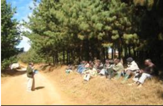
Picture 1. Discussion between tree growers and the researchers