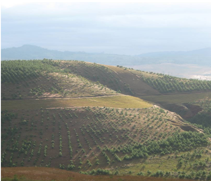
Picture 4. Fire line around the woodlots

In addition to maintaining fire lines, the following arrangements are practical for Makete district: